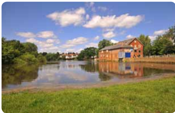
Woodmill, Swaythling

Some examples of the Navigation's old locks have been preserved by the Project with help from volunteers. Can you spot the old lock brickwork and mill buildings?