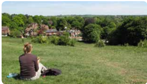
View from Shawford Down

Itchen Valley Country Park, Shawford Down and St. Catherine's Hill are great vantage points to get views across the valley.