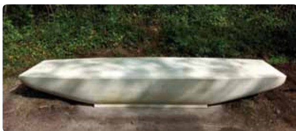
Pausing Place

Stop for a breather at the bottom of St. Catherine's Hill nature reserve and take in the view to St. Cross on this special barge shaped seat, which acknowledges the bargemen who used to work on the Navigation.