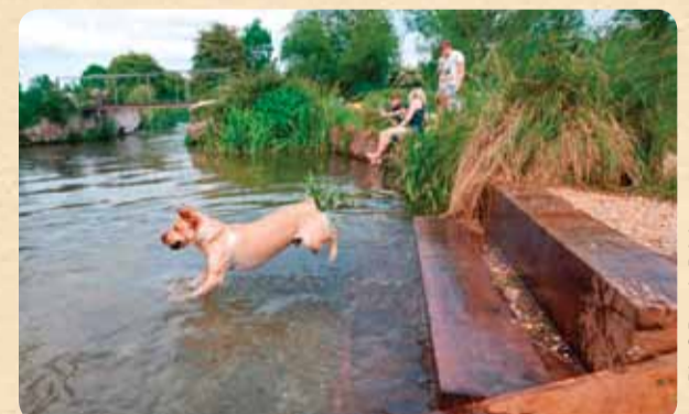
Dog Dip

If your dog likes to swim in the river, please encourage it to use the 'dog dips' at Allbrook and Shawford to get in and out of the water. This helps to stop the banks eroding, and wildlife, such as water voles and moorhens, can live along the rest of the riverbank undisturbed.