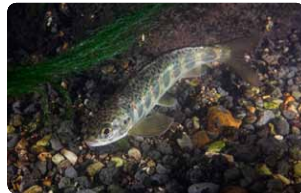
Salmon parr

The clear waters of the river are an ideal place to look for salmon, trout, grayling, minnows and pike. The channel has been improved to help fish migrate and breed.