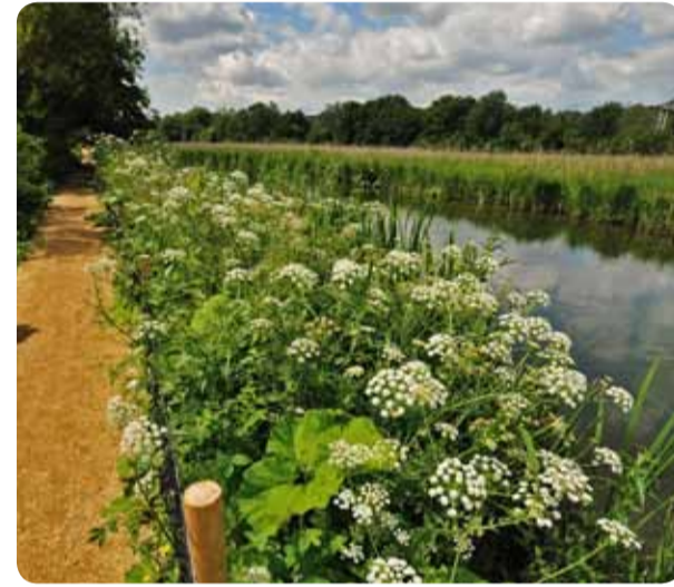
Plants by the river

The banks of the Navigation are edged with a variety of plants. Some of the vegetation has been purposely planted to protect the banks from erosion and provide food and shelter for wildlife.