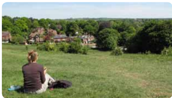
View from Shawford Down

Itchen Valley Country Park, Shawford Down and St. Catherine's Hill are great vantage points to get views across the valley.