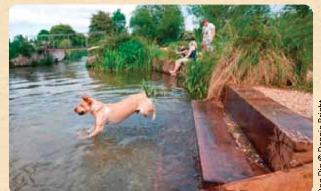
Dog Dip

If your dog likes to swim in the river, please encourage it to use the 'dog dips' at Allbrook and Shawford to get in and out of the water. This helps to stop the banks eroding, and wildlife, such as water voles and moorhens, can live along the rest of the riverbank undisturbed.