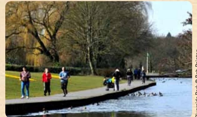
Riverside Park

The path from Woodmill Lane to Mansbridge Lock and between Compton Lock and Garnier Road are described as 'easy access' and are suitable for pushchairs and some wheelchairs.