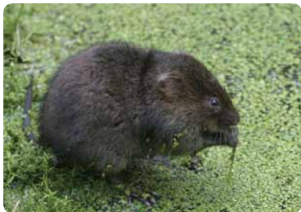
Water vole

These rare rodents are often spotted swimming across the Navigation. They live in the river banks and feed on plants by the water.