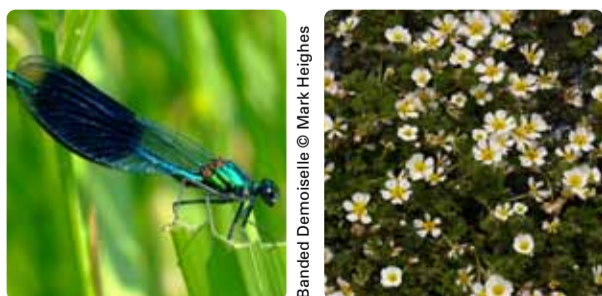
Banded Demoiselle

In summer, banded demoiselles and other dragonflies flit around the river. They also benefit from the new plants along the river banks.