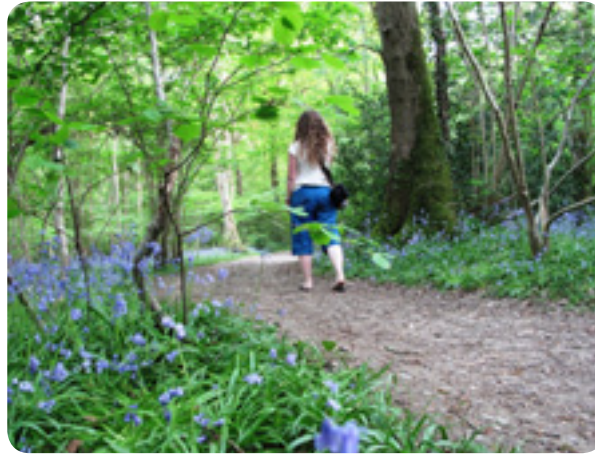
Otterbourne Park Wood

Otterbourne Park Wood is an ancient woodland managed by the Woodland Trust. It is home to many old oak, ash, maple and alder trees and boasts a wonderful display of ground flora in the spring. Ancient woodlands are over 400 years old and contain rare plants and lichens which are not found in younger woodlands.