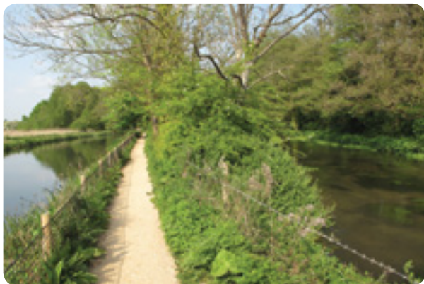
The Navigation and the river flowing side by side

South of Kiln Lane, the Itchen Navigation and the River Itchen flow side by side with just a narrow bank separating the two channels. The Wildlife Trust has carried out wildlife friendly engineering works to prevent this vulnerable bank from collapsing. Now, plants along the edge of the rivers will protect the bank from erosion and provide a home for water vole and other wildlife.