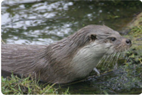
An Itchen Otter

Otters live on the Itchen and other nearby stretches of water. They tend to be active at night, when they hunt the waters for eel and other fish. During the day they lie up in sheltered 'holts', such as under tree roots near the river. Thanks to conservation efforts, otter populations on the Itchen have recovered since the 1950s, when habitat loss and persecution caused drastic declines in numbers across the UK and Europe.