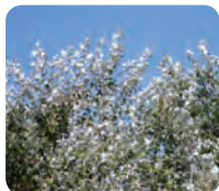
white poplar trees