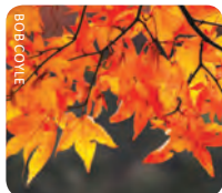
changing colours of field maple