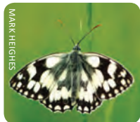
marbled white butterfly