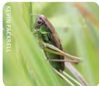
Roesel's bush cricket