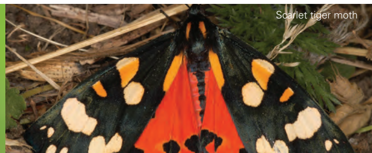
Scarlet tiger moth