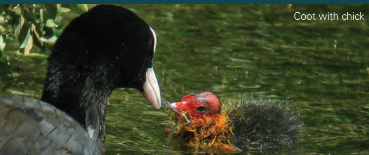
Coot with chick