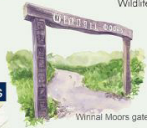
Winnall Moors gateway

Go back in time and discover how man has used the River Itchen, to provide food and protect the people of Winchester from flooding. The Itchen is an internationally important chalk river for its high quality habitats and the range of protected species that it supports – some of which you may see along the way.